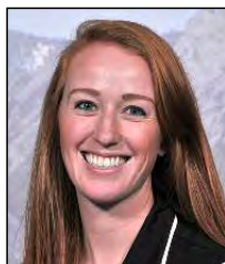
MT Eisner Sports Performance