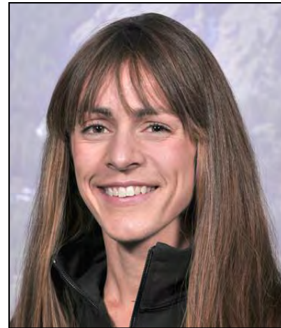
JENNY SIMPSON Volunteer Assistant Coach/ Distance Third Season