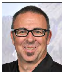
Tim Horton Equipment