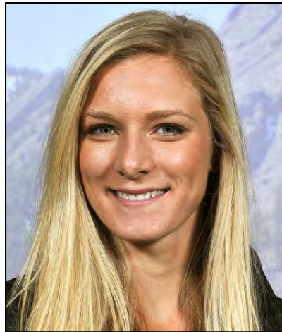
EMMA COBURN Volunteer Assistant Coach/ Distance Second Season